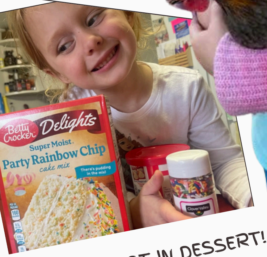
EGGS ARE BEST IN DESSERT!

WE USED EGGS FROM OUR FLOCK TO MAKE FOOD.